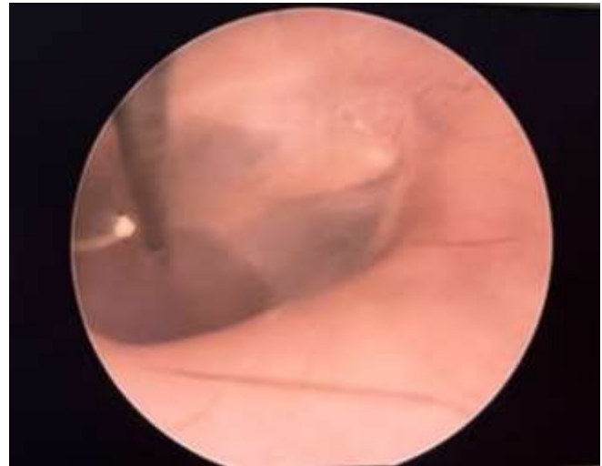
Figure-1: Meniscus of Fluid seen filling the Middle Ear Space

Wax and debris in external auditory canal were removed, after which a pyodine soaked wick was placed for 5 minutes, and lidocaine 10% was applied to anesthetize it. Patient was seated comfortably and then 1ml of mixture was injected using 0-degree endoscope through anteroinferior quadrant of tympanic membrane into the middle ear space until a meniscus of fluid can be seen completely filling the space ( Error! Reference source not found. ). After this the patient was made to lie supine for half an hour to achieve perfusion into round window niche.