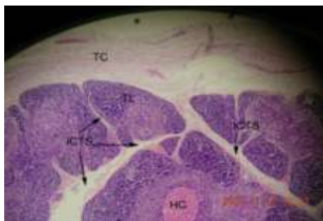
Fig-1: A photomicrograph from a section of human thymus Group-A (2 years). H & E x 40.