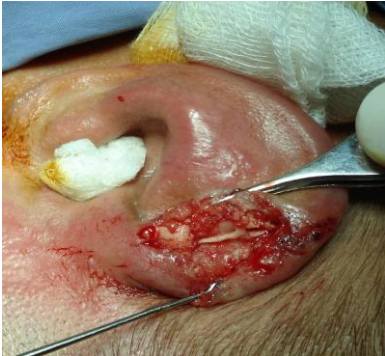
Fig. 2: Bivalve technique using long incision