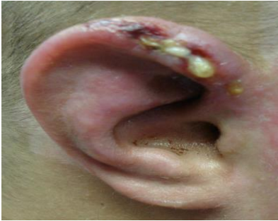
Fig.1: Post burn chondritis needing for surgical intervention