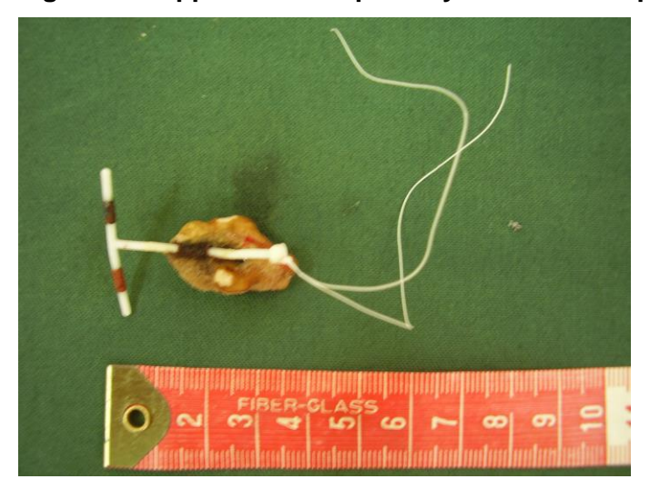
Fig. 3: Copper T retrieved from urinary bladder showing encrustation around vertical limb.