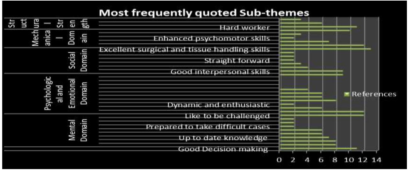
Figure-2: Graphic representation of various sub-themes of a Surgeon's personality.

The qualities of dedication, perseverance,