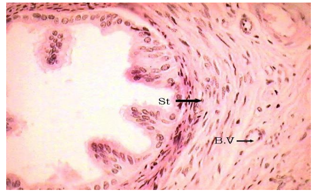
Figure-3: Photomicrograph of a cross section of uterine tubeof rat from experimental group C, showing the normal stroma. H&E stain.40X.

All the animals in control group A and experimental group C had normal histological features of oviduct stroma whereas most of rats in experimental group B treated with MSG alone had evident vacuolations in stroma of their oviducts. Our finding are similar to many