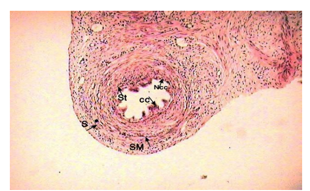
Figure-1: Photomicrograph showing cross section of uterine tube of rat from control group A showing ciliated cells (CC), non-ciliated cells (NCC), stroma (St.) and serosa (S) H&E stain 4X.

The histological sections of oviducts of group C showed three layers: serosa (external layer), myosalpinx (intermediate layer) and endosalpinx (inner layer). The cells forming the external serosal layer were flat with centrally located nuclei giving the appearance of simple squamous cells. At the inner side of this layer,