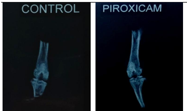
Figure-1: X-ray of rat of control group.

of control group depicted definite osteophytes with possible JSN and grade of their radiograph was 2. Fig-1 is an X-ray of a rat of control group with grade 03. Meanwhile radiograph of half rats of piroxicam group showed characteristics of doubtful JSN and possible osteophyte lipping and their grade was 01 and radiographs of other half of rats of piroxicam group exhibited features of definite osteophytes and possible JSN and their grade was 02. Figure-2 was a photomicrograph of rat of piroxicam group with minimal changes of OA and its grade was 01. Table-I is a cross tabulation of radiographic grades of both group. When these radiographs were compared with fisher exact test, we found significant p -value of <0.01 that explained that intra articular piroxicam exhibited chondroprotective effects in PTOA model of rat at radiological level.