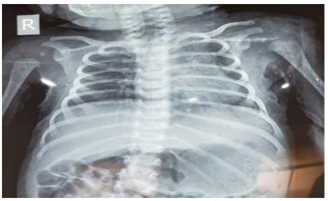
Figure-1: CXR shows normal lung fields.

incubator and all necessary standard precautions in nursing care were practiced. Renal function tests, liver function tests, serum electrolytes, PT, APTT, D-Dimers and Chest X-Ray (fig-1) were all within normal limits. Serum ferritin was 390 ng/ml (20-25 ng/ml) and LDH was 501 U/L (180-360 U/L). Blood culture showed coagulase negative Staphylococcus aureus; intravenous antibiotics were stopped after 7 days. She was