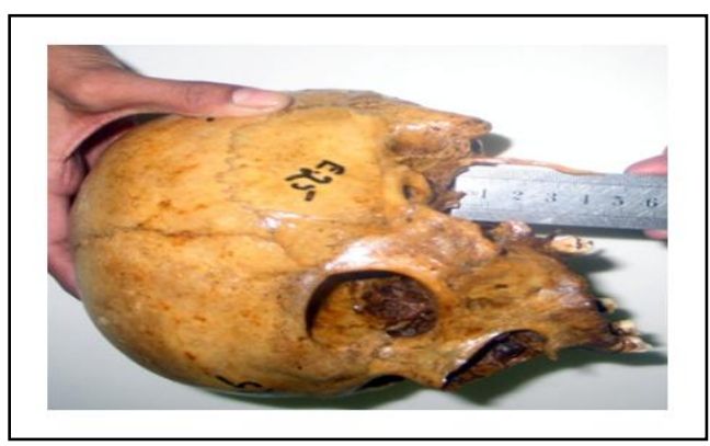
Figure-1: Measuring the left sided styloid process.

difference in occurrence in elongated styloid process<sup>12</sup>, but it is common observation that symptoms of eagle's syndrome are mostly present in female especially after 30 years of age<sup>13</sup>. Similar study was done in Brazilian population<sup>14</sup>, that also showed insignificant statistical difference in gender related elongation but prevalence in females. In contrast to this study, male population of South Kerala<sup>15</sup>, was found to be having prevalence of elongated styloid process (35%) that advances with advancing age.